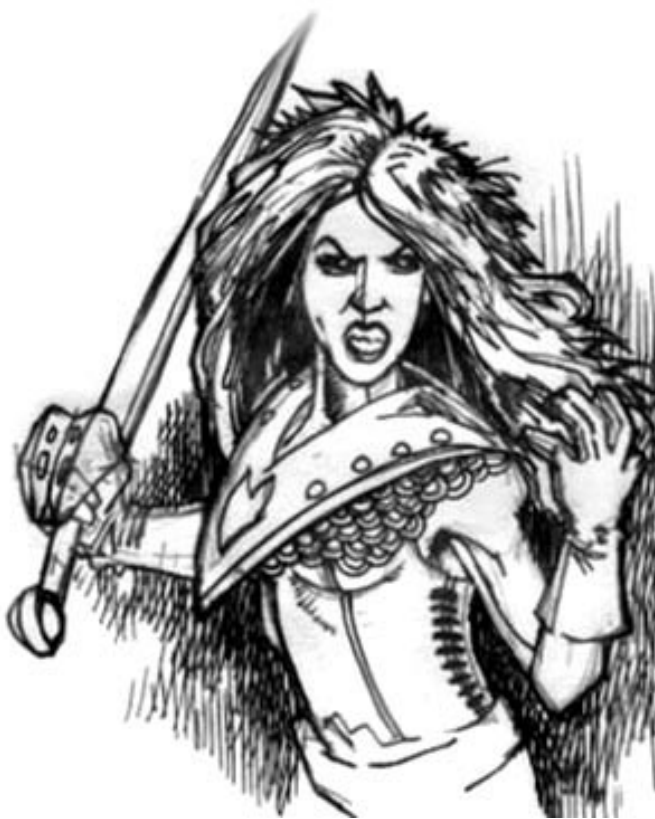
Janna d'Thuranni Performing on the Grand Stage

Greetings, Lords and Ladies! A new star has burst forth on the theatrical scene this month in Sharn—the passionate and talented Janna d'Thuranni is selling out the Grand Stage in The Demon and the Serpent , a new play based on the life of Tira Miron. Move over, Tyasha d'Phiarlan—Janna's performance is drawing rave reviews! I myself was lucky enough to attend last Sar's performance and found myself in tears, dear readers! Not only a skilled actress, Janna is also a great beauty with flashing green eyes, pale skin, and flaming red hair. Although she has risen quickly from relative obscurity, Janna is said to have already attracted many admirers and even several marriage proposals in the past few weeks. At the evening's end, I saw several hopeful young men competing with each other to toss elaborate bouquets of flowers at Janna's feet as she took her final bow. We shall certainly be following both her career and her social life closely in the weeks to come . . .